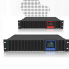
Rack Mount UPS