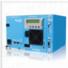
SUN UPS Series