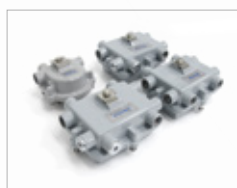
Outdoor Passive Equipments