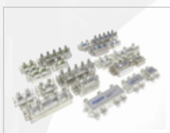
Indoor Passive Equipments