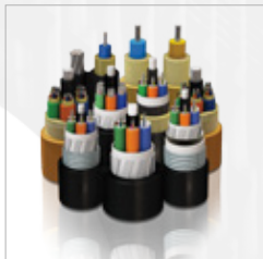
Fiber Optics Cable

ES-TECH International provides high quality products and service that meet our customers' needs based on our rich experience and technology